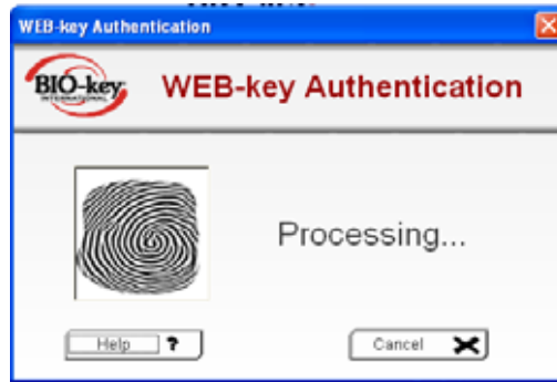
The WEB-key browser plug-in requests a finger and provides visual and textual cues for getting the best possible results.

Access to the many varied applications and systems in your environment is at your fingertips with BIO-key's ID Director for SiteMinder Secure Single Sign On.